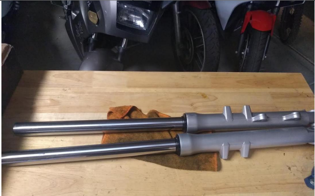
Work Completed and ready for install on bike