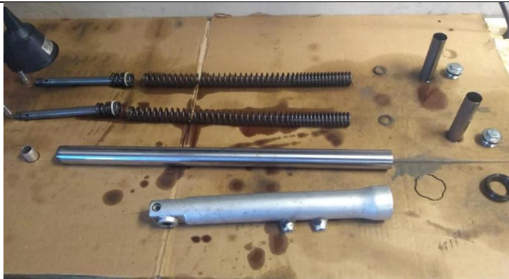
Fork Internals before cleaning